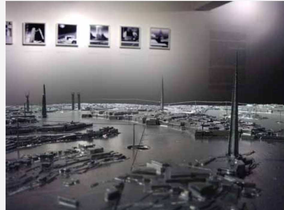
Novelletta model, London Festival of Architecture 2010. AP Valletta. Reprinted with permission. Photographer: Guillaume Dreyfuss