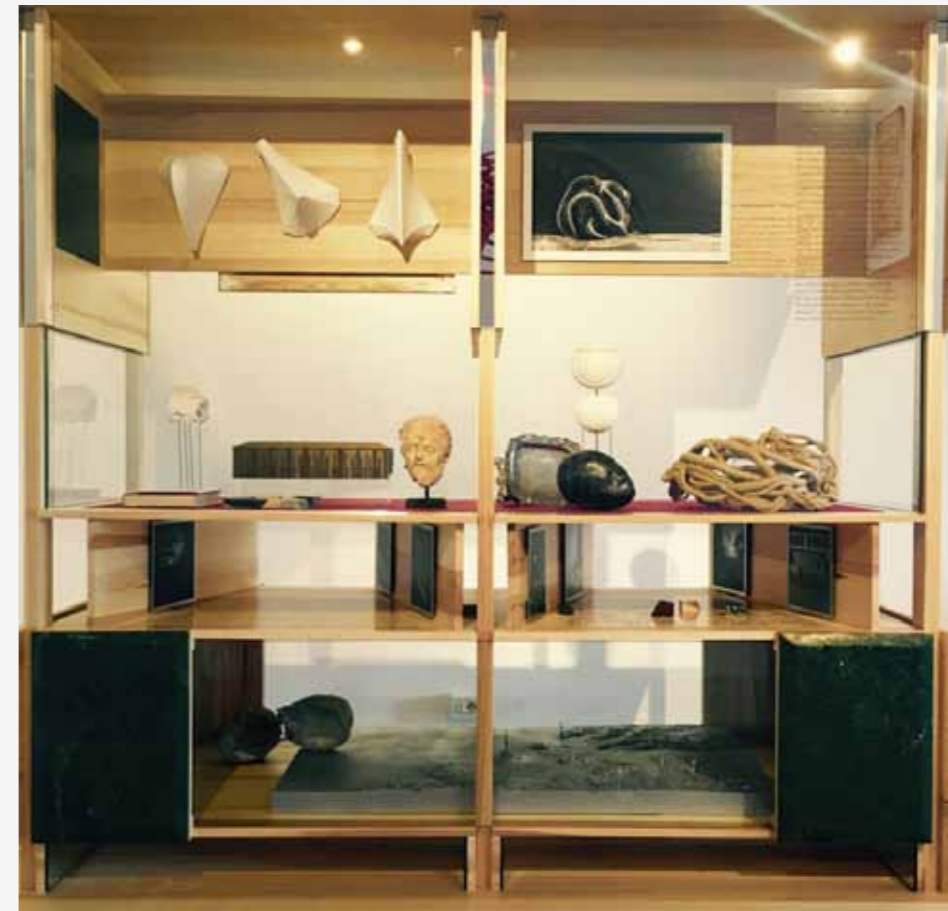
Year 2225. A triptych Installation within the collective exhibition Time Space Existence , Biennale di Architettura di Venezia, 2014. AP Valletta. Reprinted with permission. Photographer: Guillaume Dreyfuss