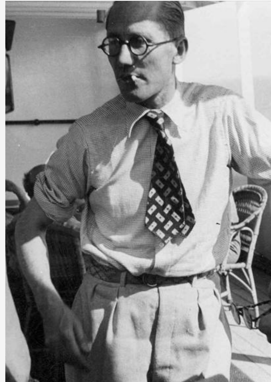
Le Corbusier with his colleagues aboard the Patris II during CIAM 4 (1933).