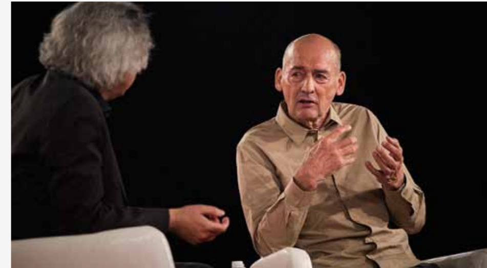
Rem Koolhaas in conversation with Mohsen Mostafavi at the AIA Convention, 2016. From "Architecture has a serious problem today" in Fastocodesign.com. Reprinted with permission, courtesy of the AIA. Photographer: Carl Bower.