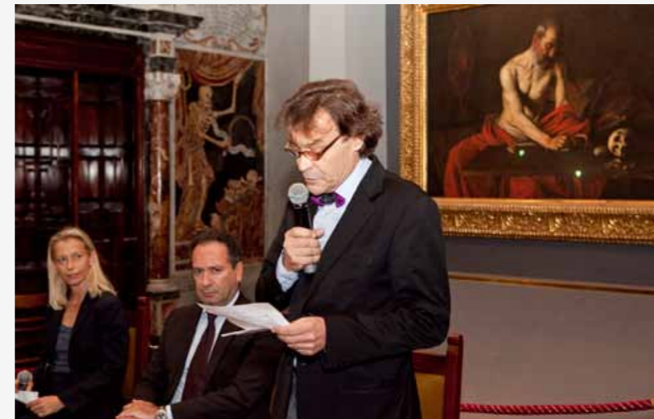
Manfred Gaulhofer announcing Valletta as European Capital of Culture for 2018 during a press conference held at St. John's Co Cathedral (2012).

The story of the European Capitals of Culture is a relatively recent one. It was an idea born at Athens Airport in January 1985.