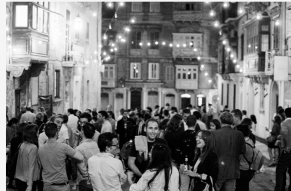
In Pursuit of Dreams, AP's Sappers Street Party within Malta Design Week (2014). AP Valletta. Reprinted with permission. Photographer: Seb Tanti Burlo