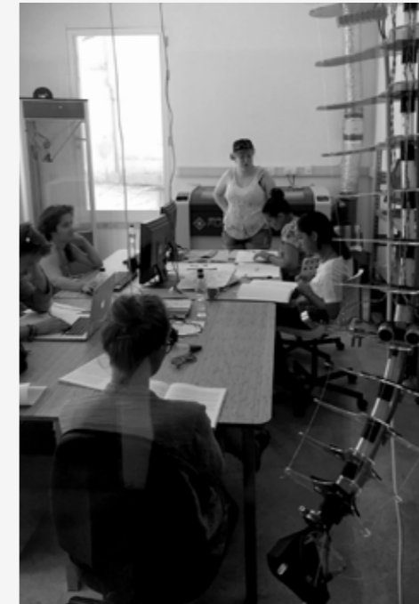
Students working at fablabvalletta during the EASA workshop 2015.