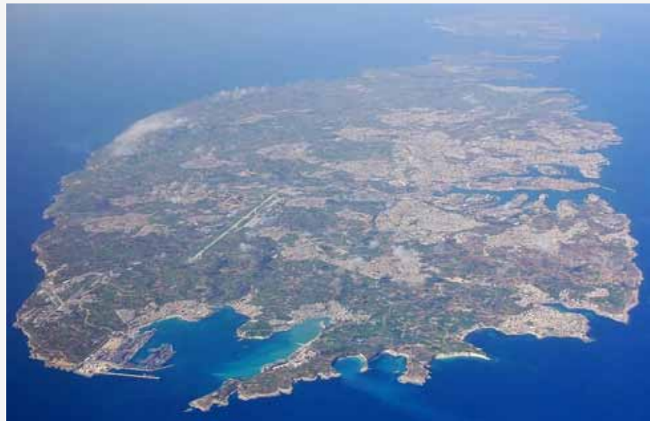
The Greater Valletta, aerial view. Reprinted with permission. Photographer: Roberto Benetti

Sketch , that, 'Strada Pozzi, behind the old Military Hospital, is popularly known as 'L-Arcipierku' (the archipelago), probably because (of) the many lanes which break up the place into numerous islands of small houses.' 24