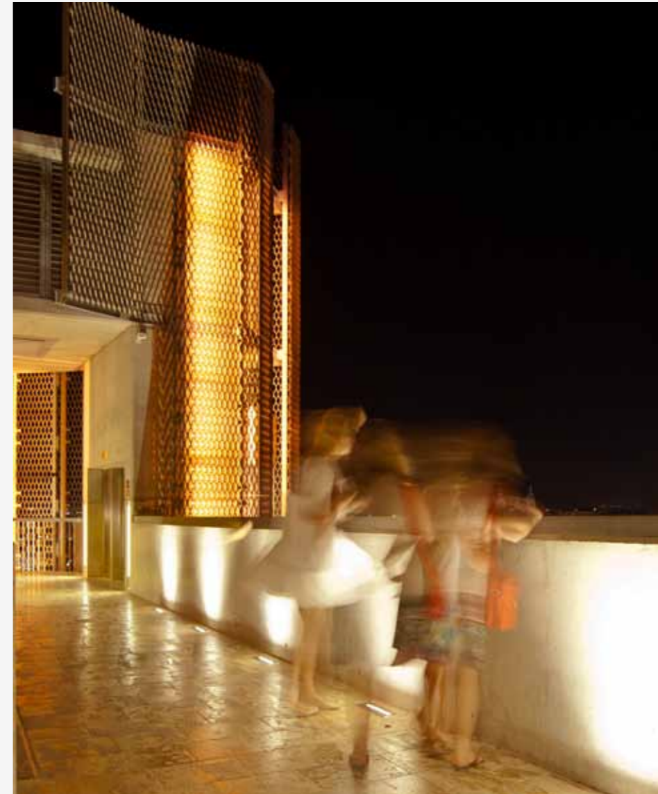
Barrakka Lift, AP Valletta, Valletta.