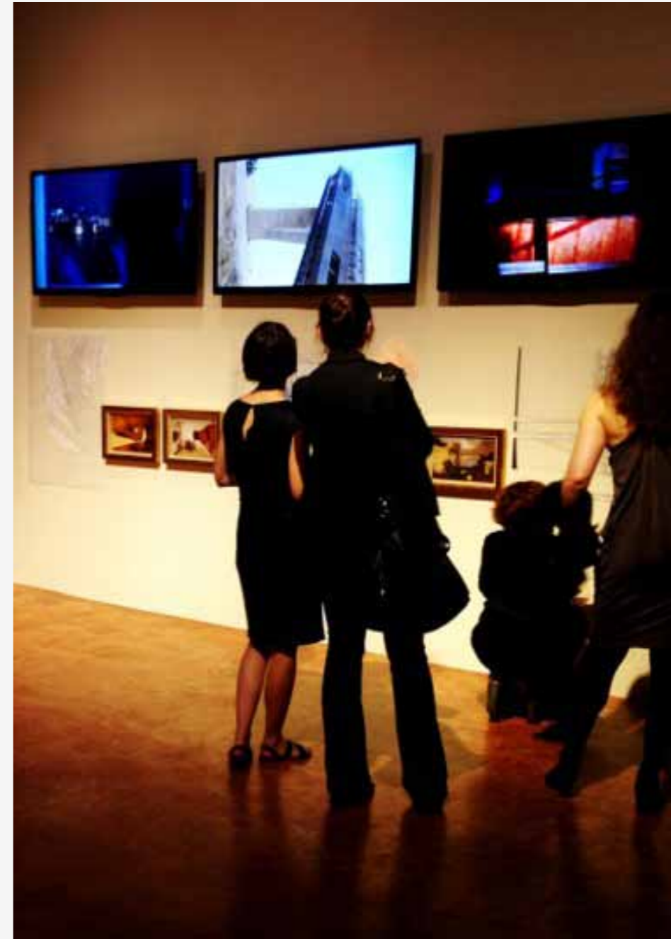
Reasonable Dreams, La Galerie d'Architecture, Paris, 2013. AP Valletta. Reprinted with permission.