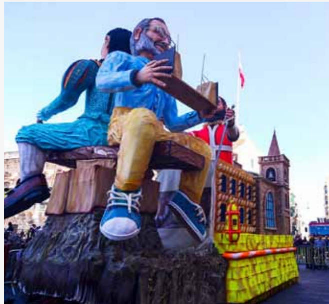
Carnival in Valletta, 2016.