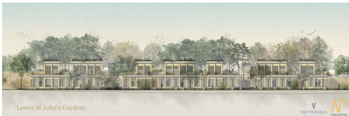
A render of the Lower St John's Gardens.

"The project also aligns perfectly with our commitment to enhance Valletta's cultural and