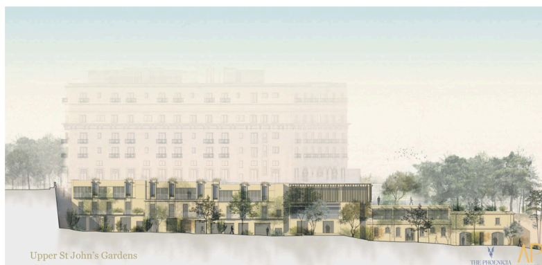
The Phoenicia Malta St John's Gardens proposal. Right: An impression of the Upper St John's Gardens development.